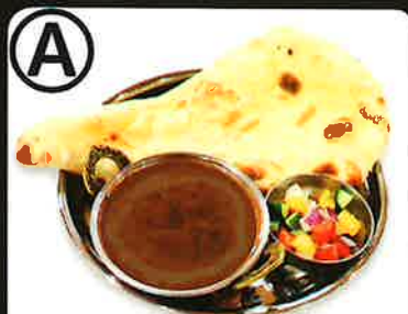
Curry, Naan (L), Today's Salad

Please adjust the spiciness to your liking with chili powder on the table.