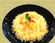
R17 NAVRATAN PILAU