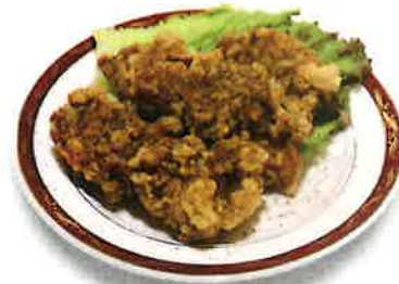
F4 SPICE KARAAGE ¥680 Fried chicken made from chicken marinated in garlic, gingerand spices, then coated in original flour and deep-fried. (Tasty Hot)