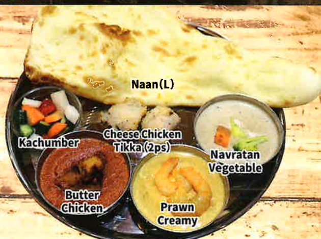
SET9 DELUXE MILD SET ¥1,880