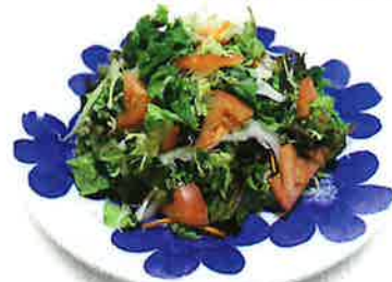
S1 INDIAN GREEN SALAD ¥580 Green vegetable salad (leafy) with vege dressing

※It will be sold out sometimes. ※Photo is image