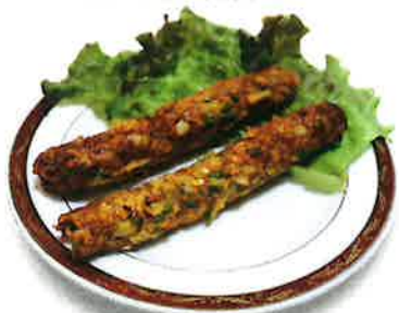
T4 SUNHERI CHICKEN SHEEK ¥680 Tandoor Minced Chicken with chopped vegetable on stick.

※This menu is not available in our store.