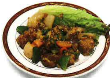
G1 CHICKEN CHILI ¥780 Deep fried chicken, stir fried vegetables, seasoned with chili peppers, etc. and thickened. (Tasty Hot)