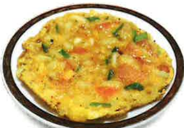
G4 MASALA OMLET ¥480 Egg Omlet w/spice, onion, tomato... (Tasty Hot)

✂ This menu is not available in our store.