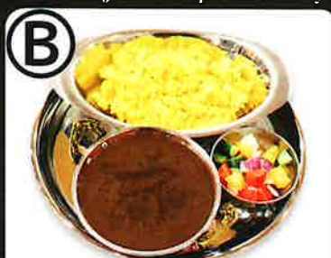
Curry, Turmeric Rice (L), Today's Salad