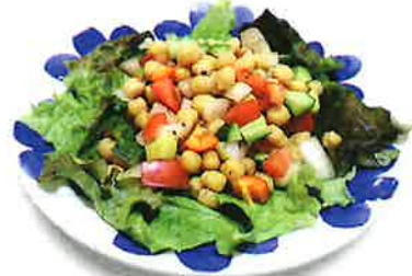
S2 CHANA DAL SALAD ¥540 Our original salad w/ spiced chickpeas·onion (Tasty Hot)