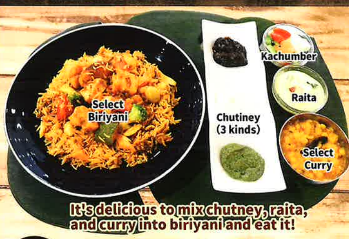
SET12 BIRIYANI SET ¥1,680