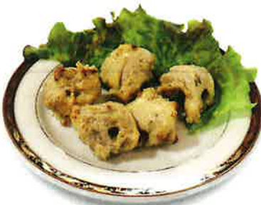
T2 CHEESE CHICKEN TIKKA ¥680 Tandoor Chicken dipped in fresh cream, cheese.