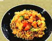
R13 VEGETABLE BIRIYANI