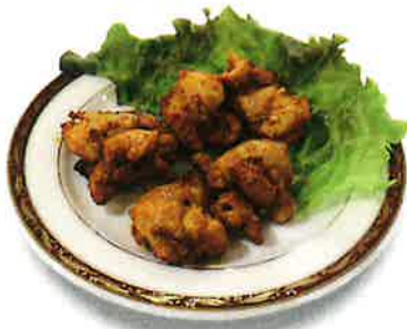
T1 NATURAL CHICKEN TIKKA ¥580 Tandoor Chicken dipped in yogurt, spice.