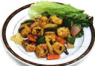
G2 PANEER CHILI ¥980 Deep fried cheese, stir fried vegetables, seasoned with chili peppers, etc. and thickened. (Tasty Hot)

✂ This menu is not available in our store.