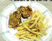
SF Fried (2 kinds)

※This menu is not available in our store.