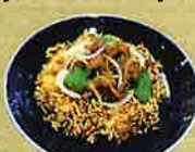
R15 PORK BIRIYANI