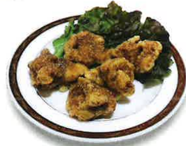
F2 FRIED CHICKEN TIKKA ¥680 Fried chicken dipped in yogurt, spice & covered with original powder.