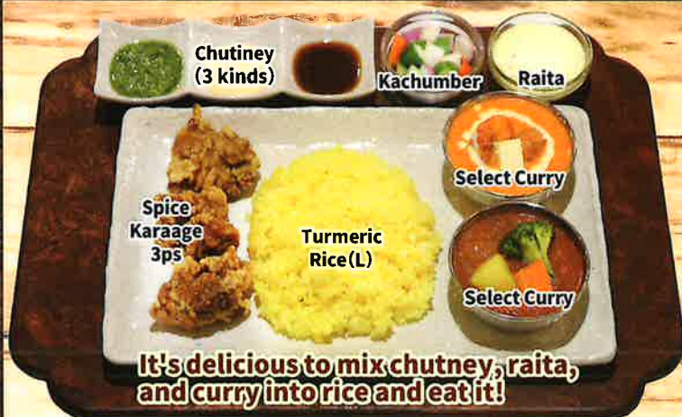
SET11 KARAAGE MEALS SET ¥1,780