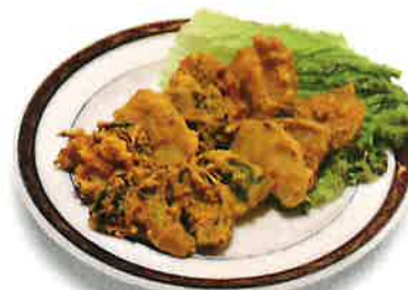
F5 VEGETABLE PAKORA ¥580 The vegetables are coated with a batter made from chickpea flour dissolved in water and spices, then fried in oil.