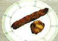
ST Tandoori (2 kinds)

※Please choose from SET10 a la carte selections here. ※Each a la carte (2 kinds) is whimsical.