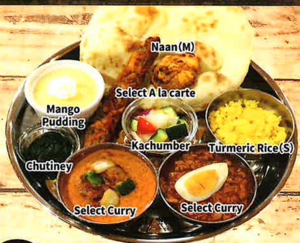
SET10 OTONA KIDS SET ¥1,980