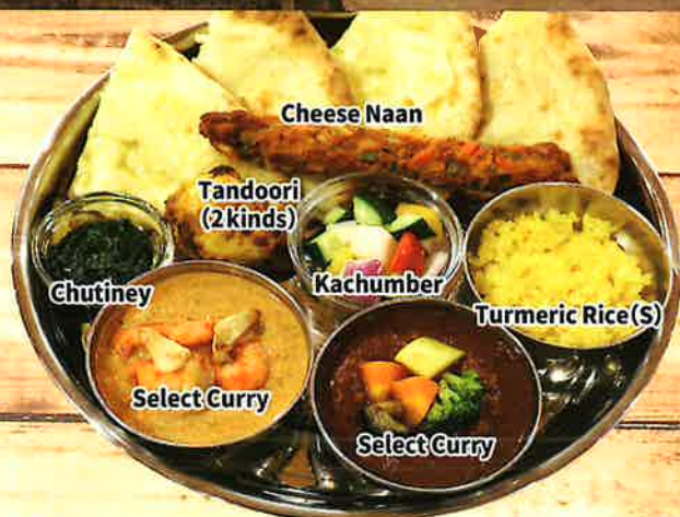
SET8 DELUXE CHEESE NAAN SET ¥1,980