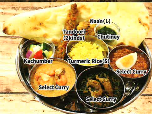
SET7 MAHARAJA SET ¥2,180