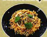
R11 CHICKEN BIRIYANI

※Please select your SET12 biryani from here