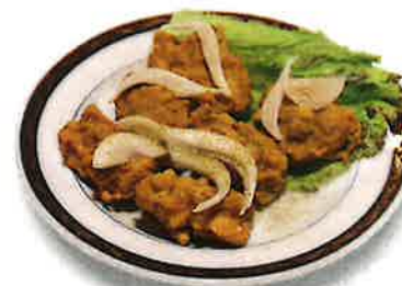
F6 CHICKEN PAKORA ¥680 The chicken is coated with a batter made from chickpea flour dissolved in water and spices, then deep fried.