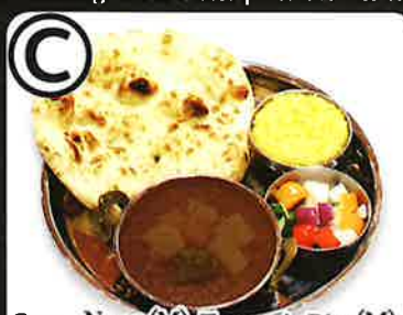
Curry, Naan (M), Turmeric Rice (M), Today's Salad