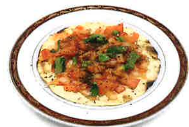
S11 MASALA PAPAD ¥240 Spiced onion·tomato on bean snack. (Tasty Hot)