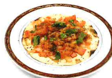
S11 MASALA PAPAD ¥240 Spiced onion·tomato on bean snack. (Middle-Hot)