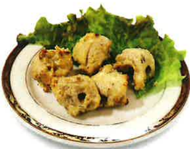
T2 CHEESE CHICKEN TIKKA ¥680 Tandoor Chicken dipped in fresh cream, cheese.