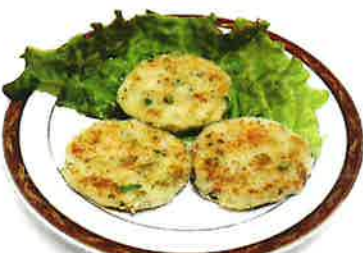
G3 VEGETABLE TIKKI ¥580 Grilled paste of vegetable, potato, spice, cheese (Middle-Hot)