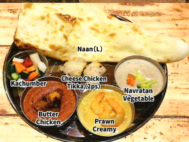
SET9 DELUXE MILD SET ¥1,980