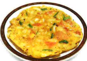
G4 MASALA OMLET ¥480 Egg Omlet w/spice, onion, tomato... (Middle-Hot)