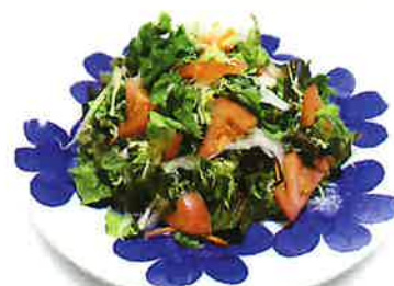
S1 INDIAN GREEN SALAD ¥580 Green vegetable salad (leaf..) with vege dressing

* It will be sold out sometimes. * Photo is image