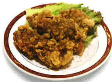
F4 SPICE KARAAGE ¥680 Fried chicken made from chicken marinated in garlic, gingerand spices, then coated in original flour and deep-fried. (Middle-Hot)