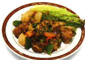
G1 CHICKEN CHILI ¥780 Deep fried chicken, stir fried vegetables, seasoned with chili peppers, etc. and thickened. (Middle-Hot)