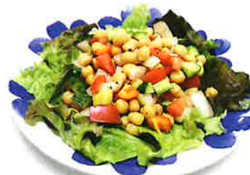
S2 CHANA DAL SALAD ¥540 Our original salad w/ spiced chickpeas·onion (Middle-Hot)