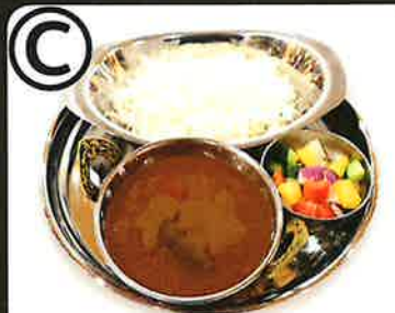
Curry, Basmati rice (L), Today's salad