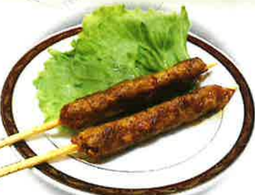
G5 CHICKEN SHEEK GRILL ¥580 Spiced minced chicken thighs skewered and grilled in a frying pan. (Middle-Hot)