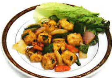
G2 PANEER CHILI ¥980 Deep fried cheese, stir fried vegetables, seasoned with chili peppers, etc. and thickened. (Middle-Hot)