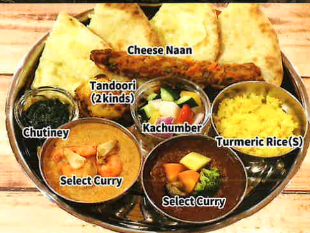
SET8 DELUXE CHEESE NAAN SET ¥1,980