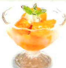
DT3 FROZEN MANGO Cut mangoes frozen for easy eating. ¥400