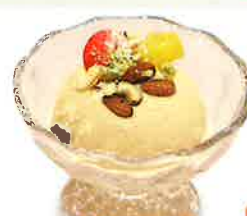
DT5 KABLI VANILLA ICE CREAM Dry fruits・nuts on vanilla ice cream. ¥400