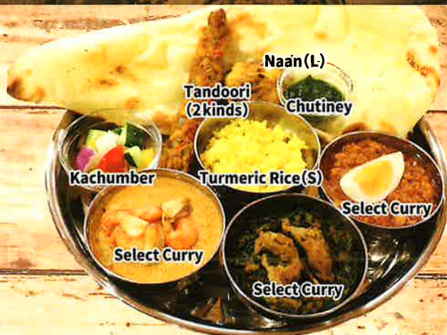
SET7 MAHARAJA SET ¥2,180

※Tandoori (2 kinds) are whimsical. ※Photo is image. ※Prices include tax.