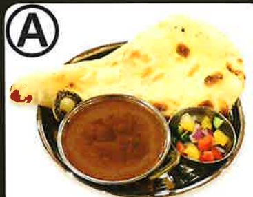
Curry, Naan (L), Today's salad

Please adjust the spiciness to your liking with chili powder on the table.