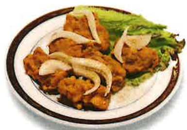
F6 CHICKEN PAKORA ¥680 The chicken is coated with a batter made from chickpea flour dissolved in water and spices, then deep fried.