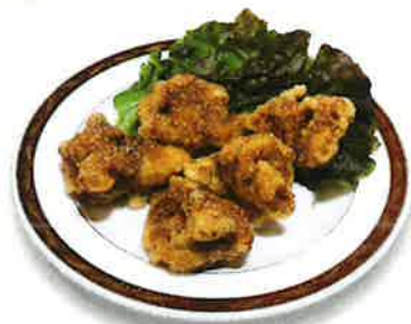
F2 FRIED CHICKEN TIKKA ¥680 Fried chicken dipped in yogurt, spice & covered with original powder.