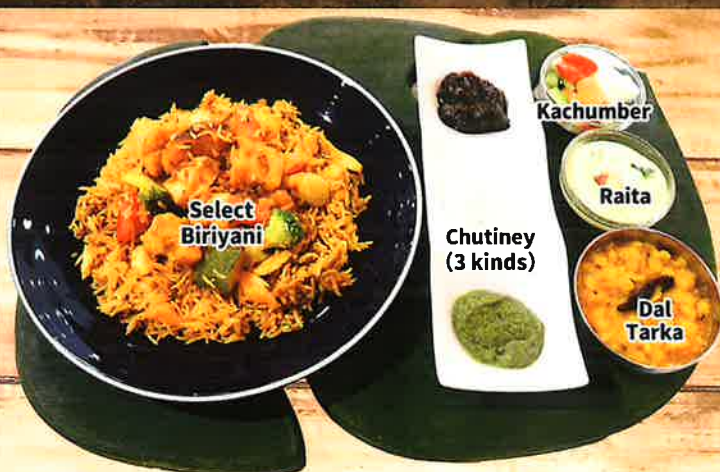
SET12 BIRIYANI SET ¥1,580