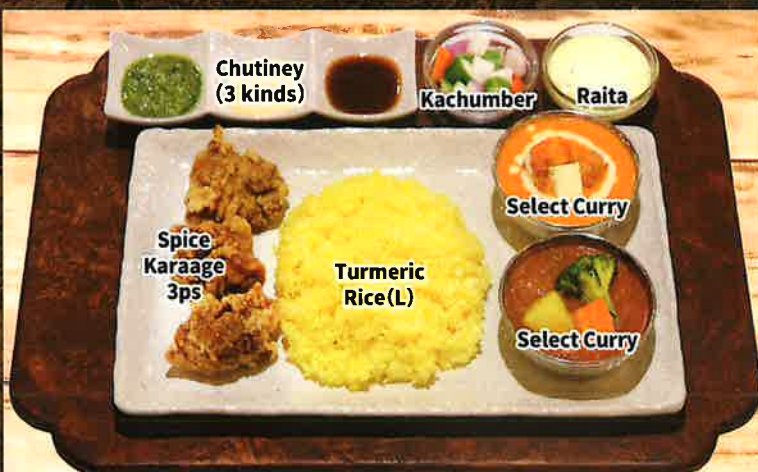
SET11 KARAAGE MEALS SET ¥1,780