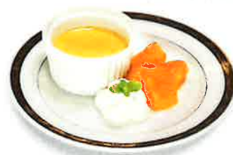
DT4 MANGO PUDDING PLATE Special pudding using mango and topped with frozen mango. ¥400