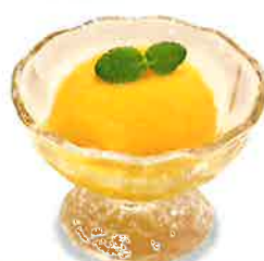
DT2 MANGO SHERBET Sherbet made with mango. ¥400