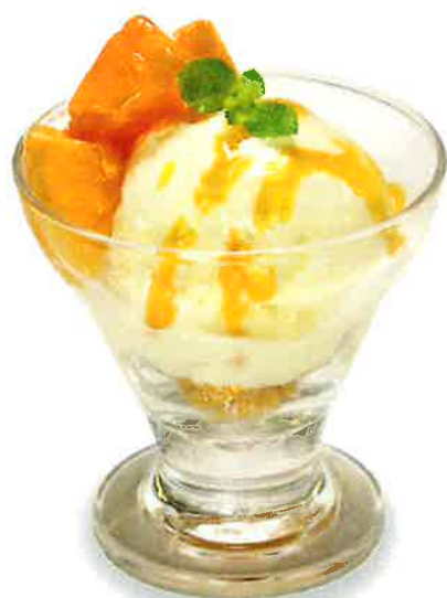
DT1 MINI MANGO PARFAIT Mini parfait with frozen mango vanilla ice cream, etc. ¥400