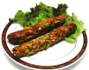
T4 SUNHERI CHICKEN SHEEK ¥680 Tandoor Minced Chicken with chopped vegetable on stick.