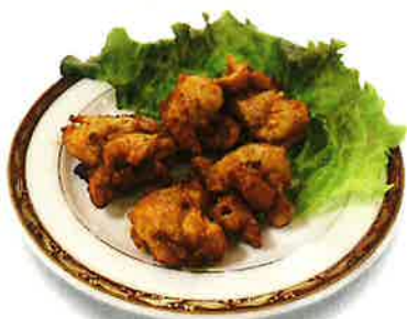
T1 NATURAL CHICKEN TIKKA ¥580 Tandoor Chicken dipped in yogurt, spice.