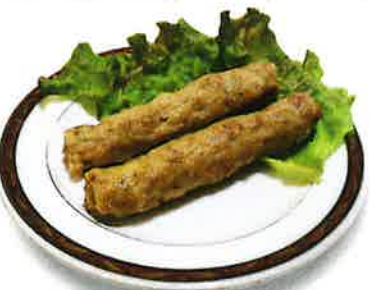
T5 CHEESE CHICKEN SHEEK ¥680 Tandoor Minced Chicken with fresh cream•cheese on stick.