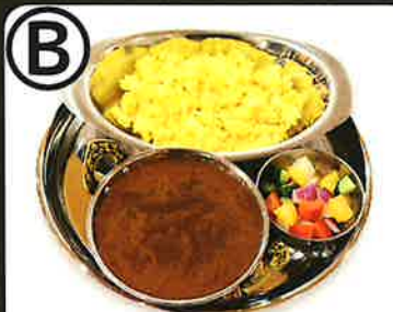
Curry, Turmeric rice (L), Today's salad