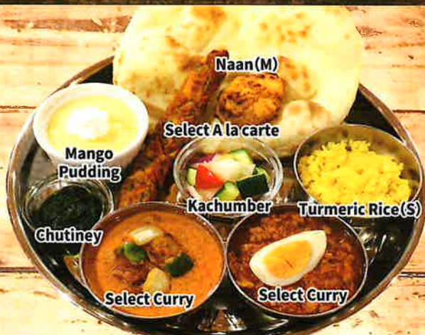
SET10 OTONA KIDS SET ¥1,980