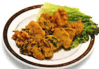
F5 VEGETABLE PAKORA ¥580 The vegetables are coated with a batter made from chickpea flour dissolved in water and spices, then fried in oil.